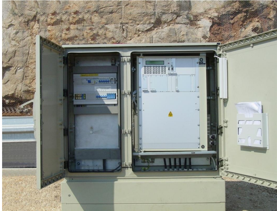
Picture 3: Roadside Outstation independently controls traffic in Local automatic response mode

case of activation of alarm algorithm information about changed status of traffic signalization, cause of alarm mode of LAR and the status of alarm mode is passed on to control center.